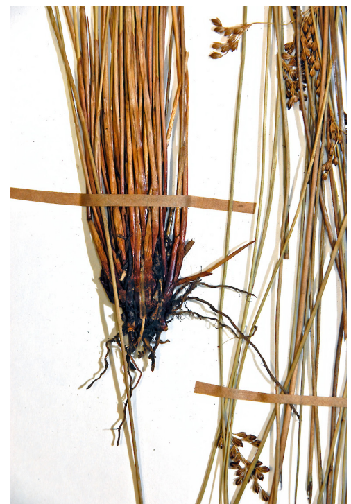
Herbarium specimen: AK 151734.