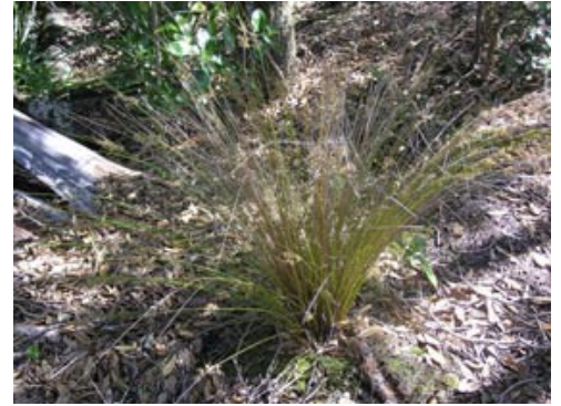
Islington Bay 12 April 2006. Photographer: Mike Wilcox, Licence: All rights reserved.