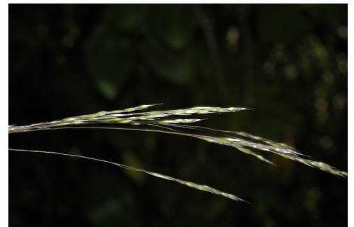
Pa Hill, Coromandel.