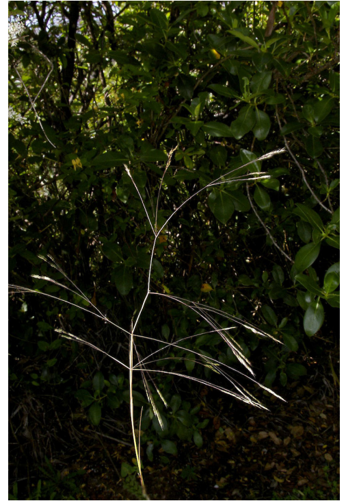
Pa Hill, Coromandel.