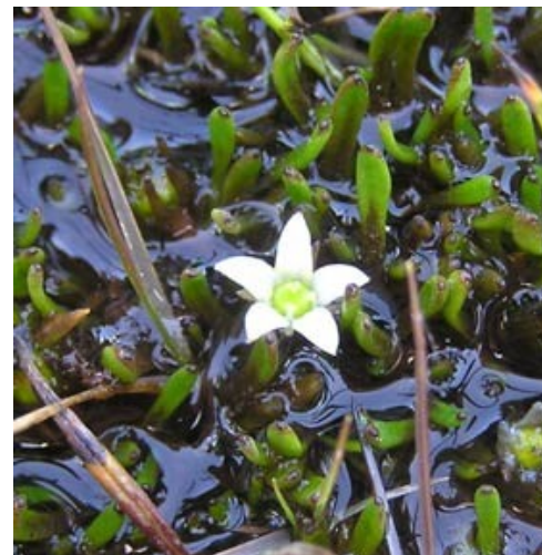
Mt Hauhungatahi, 1350 m, 5 Feb 2006.