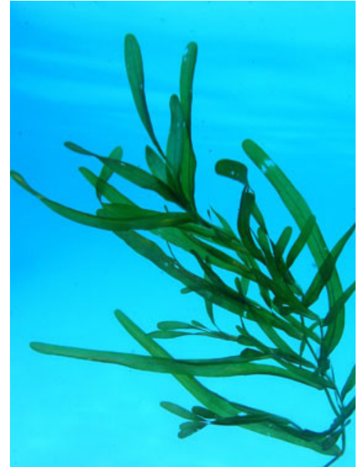
Potamogeton ochreatus. Photographer: Rohan Wells, Licence: All rights reserved.