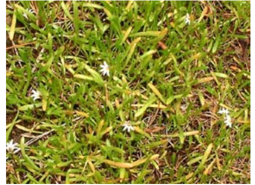
Coromandel, December.