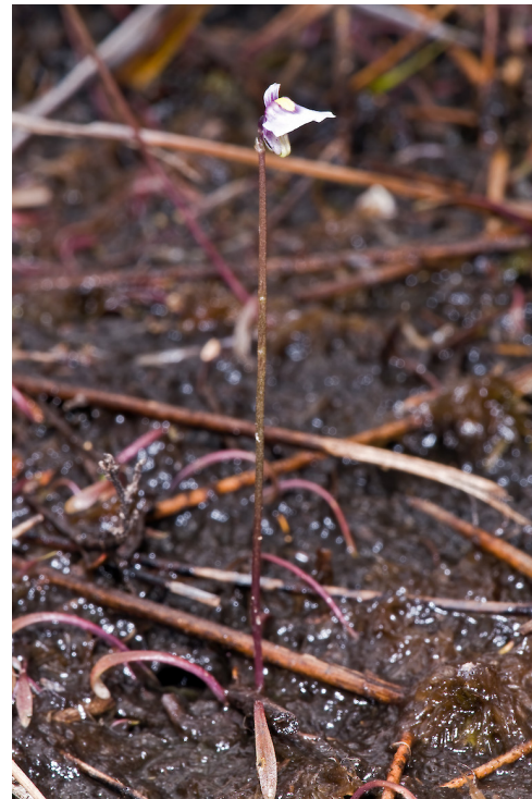
Karikari Peninsula.