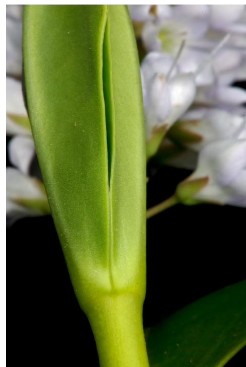
Base of leaf bud. In cultivation. Photographer: Jeremy R. Rolfe, Date taken: 21/10/2007, Licence: CC BY.