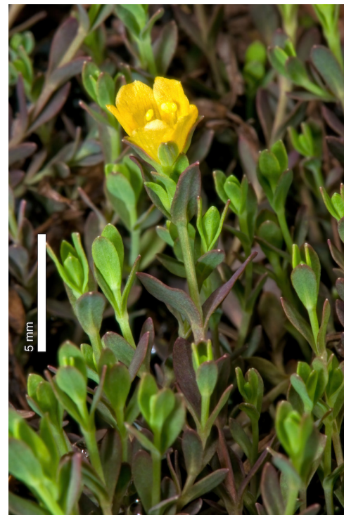
In cultivation ex Rangitaiki. Date taken: 03/11/2008, Licence: CC BY.