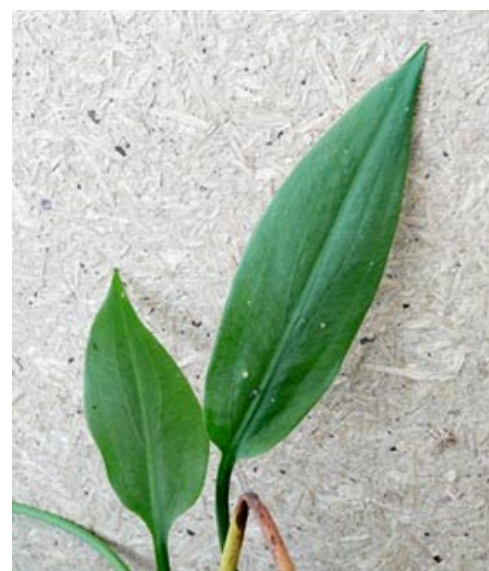
Taupo Swamp, Plimmerton. Apr 2007. Photographer: Robyn Smith, Licence: CC BY-NC.