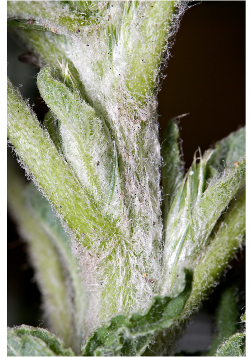
Stems densely hairy. Hutt River Trail north of Stokes Valley, Lower Hutt.