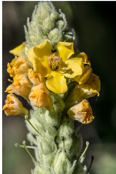
Lower Hutt.