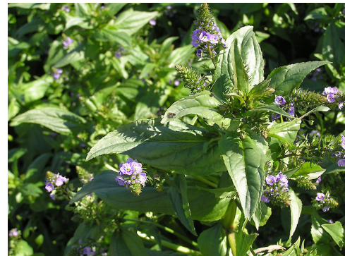
Veronica anagallis-aquatica - Waikato Heads.