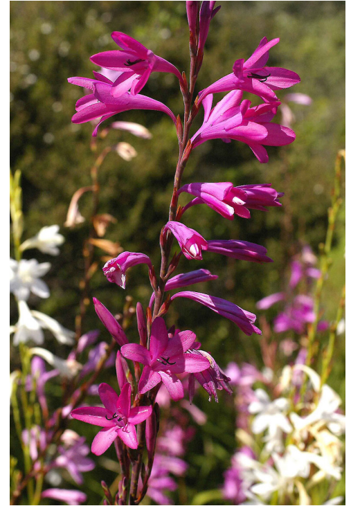
Watsonia meriana.