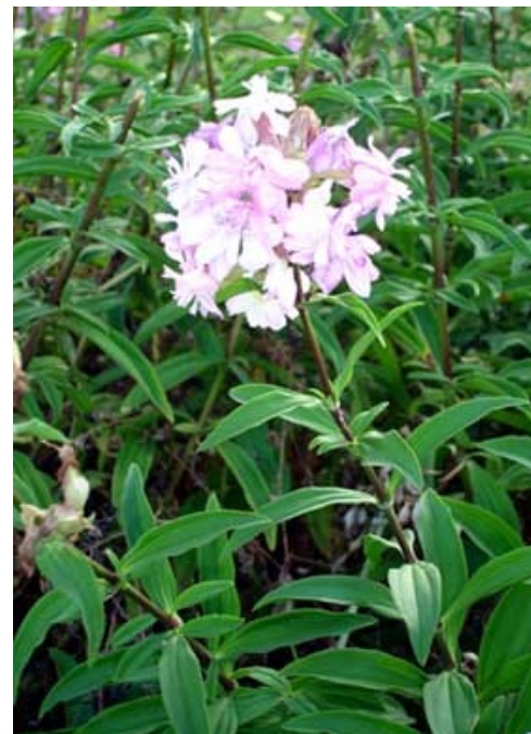
Auckland. Feb 2007.