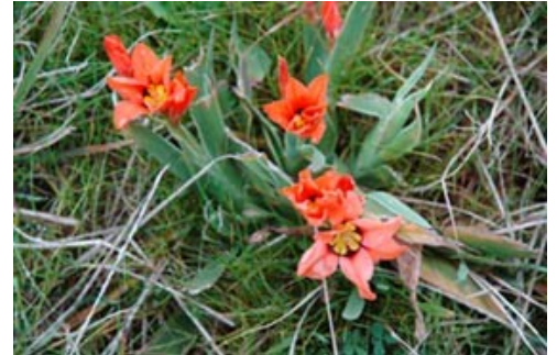
Koitiata Domain (nr Wanganui). Sep 2007. Photographer: Colin C. Ogle, Licence: CC BY-NC.