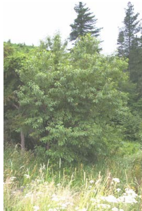
Prunus cerasifera . Photographer: John Smith-Dodsworth, Licence: CC BY-NC.