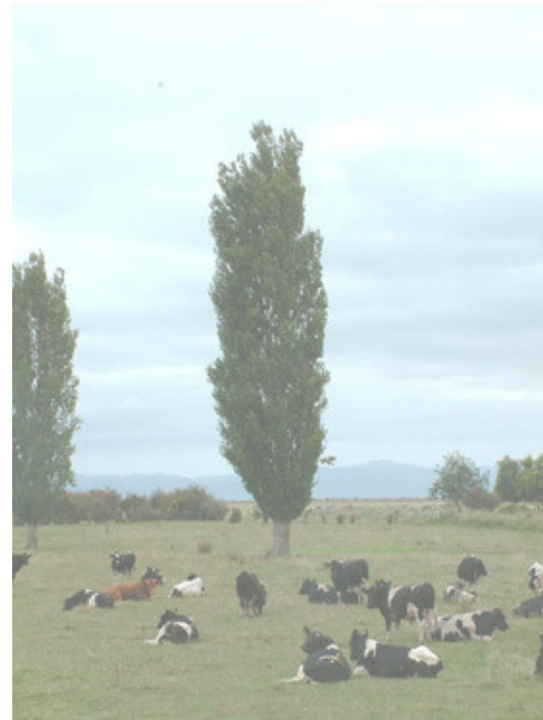
Populus nigra. Photographer: John Smith-Dodsworth, Licence: CC BY-NC.