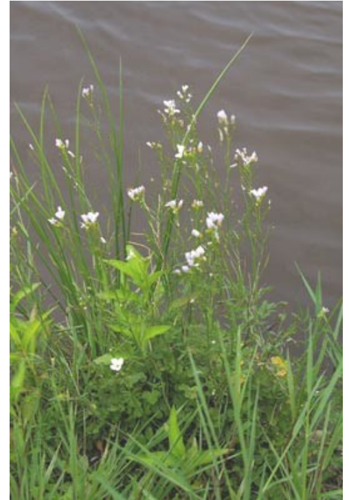
Hauraki swamp, December.