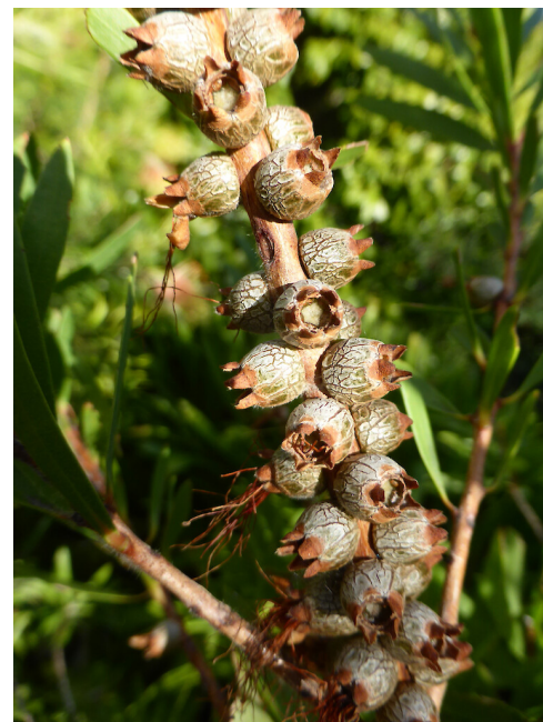
Ex-nursery plant, planted in a garden on St John's Hill, Whanganui. Date taken: 03/04/2020, Licence: Public domain.