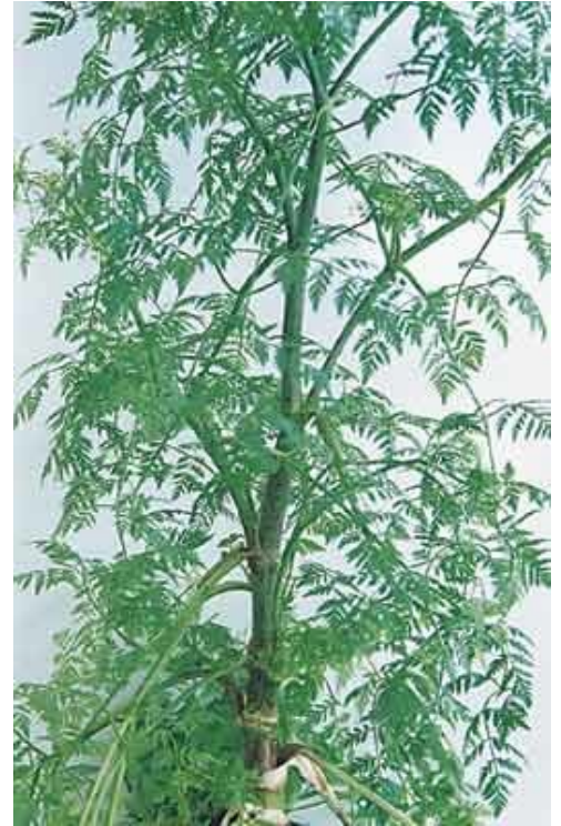
Conium maculatum . Photographer: Auckland Regional Council, Licence: Public domain.