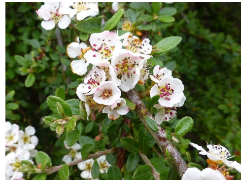
Wisely, England, flowers. Photographer: Colin C. Ogle, Date taken: 17/06/2013, Licence: CC BY-NC.