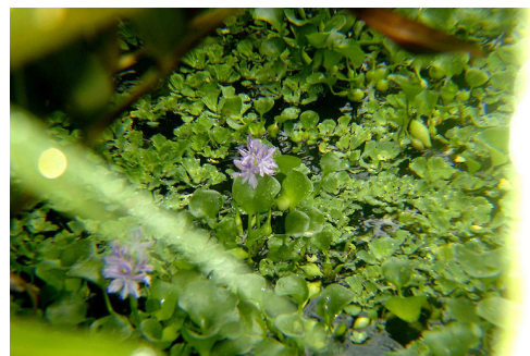
Singapore.