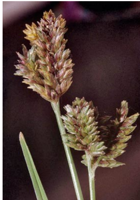
Hastings. Feb 2004.