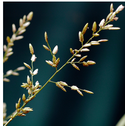
Inflorescence. Wanganui, Feb 2011. Photographer: Colin C. Ogle, Licence: CC BY-NC.