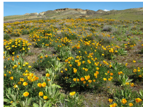
Bannockburn sluicings.