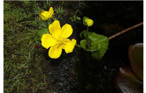
Caltha palustris, in cultivation.