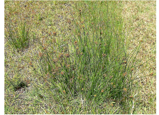
Juncus effusus var. compactus.