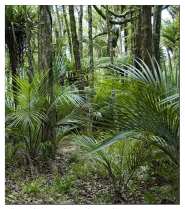
Nikau ( Rhopalostylis sapida ) seedlings.

Plant of the Month for October is the endemic nikau palm (Rhopalostylis sapida). This is primarily a species of coastal to lowland forest in the warmer parts of New Zealand. It is found in North Island and in South Island from Marlborough Sounds and Nelson to Okarito in the west and Banks Peninsula in the east. The nikau palm forms a tree with a trunk up to 15 m and has fronds up to 3 m long. The tree is not threatened but was chosen as Plant of the Month because it is currently in the Top 5 in the Network's on-line vote for New Zealand's favourite plant. The palm on the Chatham Islands is probably distinct from R. sapida but further research is required. Chatham Islands plants have a distinct juvenile form, larger fruits, and thicker indumentum on the fronds. The Network fact sheet for the nikau palm may be found at: www.nzpcn.org.nz/nz_threatenedplants/detail. asp?PlantID=1290