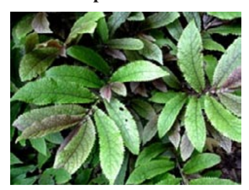
Parataniwha ( Elatostema rugosum ), New Zealand's 5th favourite plant in 2006.

Voting for New Zealand's favourite indigenous plant is now open for 2007 via the website of the New Zealand Plant Conservation Network (see <a href="https://www.nzpcn.org.nz">www.nzpcn.org.nz</a>). Please help us find New Zealand's favourite indigenous plant for 2007.