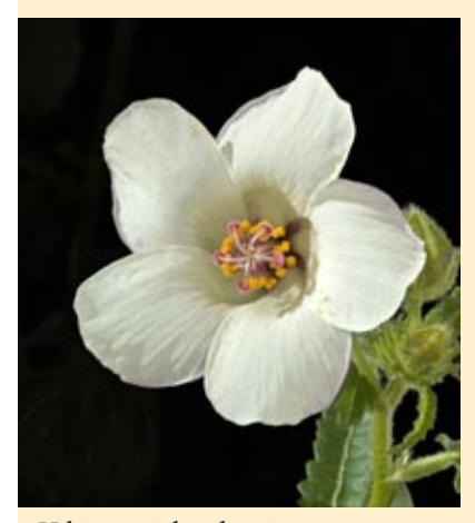
Hibiscus richardsonii .

The indigenous, Nationally Critical Hibiscus richardsonii (the native hibiscus or puarangi)—erroneously referred to as Hibiscus trionum —is found in North Island, from Te Paki eastward to Hicks Bay, including Great Barrier and Mayor (Tuhua) Islands and also in Australia (New South Wales). This annual to short-lived perennial herb up to 1 m tall is strictly coastal, growing in recently disturbed habitats, such as around slip scars, within petrel colonies, on talus slopes and under open coastal scrub and forest. It is very palatable to stock, and is prone to being outcompeted by faster growing and taller weeds. As a species requiring open ground, it is especially vulnerable to this threat. The Network fact sheet for Hibiscus richardsonii may be found at: www.nzpcn.org.nz/vascular plants/detail.asp?plantid=2378