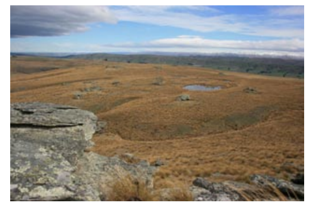
Trig J, Macraes, 2007.

Macraes is situated 45 km north of Dunedin, 25 km inland from the coast and ranges in altitude from 400 m to 714 m a.s.l. The area under investigation consists of hybrid Chionochloa tussock grassland and short tussock grassland induced by Maori and pastoralist clearance of the original semi-arid podocarp forest and small-leaved shrubland on ridge crests and the mesic broadleaf forest from hill slopes and drainages. Only remnants of these vegetation communities remain. Twenty-six species, thought to be shade-dependent shrubland- or forest-floor