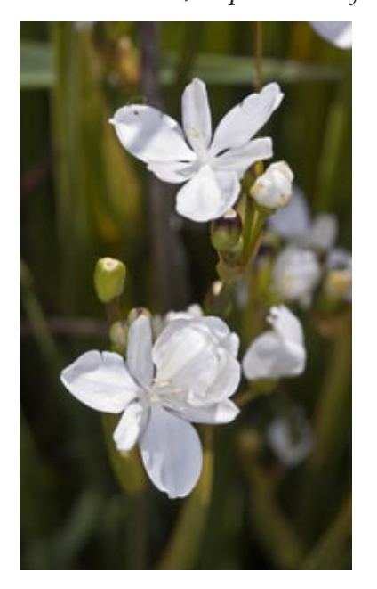
Libertia cranwelliae in cultivation.

Graeme Atkins, Department of Conservation, East Cape