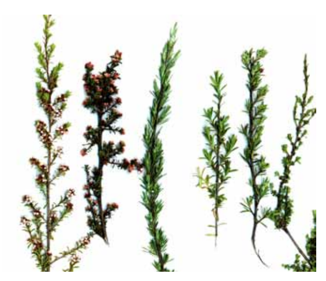
Fig. 2. Diversity in the New Zealand Kunzea ericoides complex. From left to right, Kunzea ericoides var. microflorum (two forms – both flowering), K. ericoides var. linearis (sprig with flower buds), K. aff. ericoides (b) (showing a vegetative sprig and branchlet with flower buds), K. aff. ericoides (c) (vegetative material).

http://www.issg.org/database, accessed 5 November 2010). This view prevails despite various attempts by this author to rectify it, such that Kunzea ericoides is still being touted as a serious weed in New Zealand using Australian data based on allied but quite different species (Singer & Burgman 1999 – their " K. ericoides " is actually a mixture of a very localised Victorian endemic K. leptospermoides and an unnamed species K. aff. ericoides (g)). The result is that this New Zealand species complex is being sprayed and killed over large parts of our country by people who genuinely believe the misinformation available on websites such as that above.