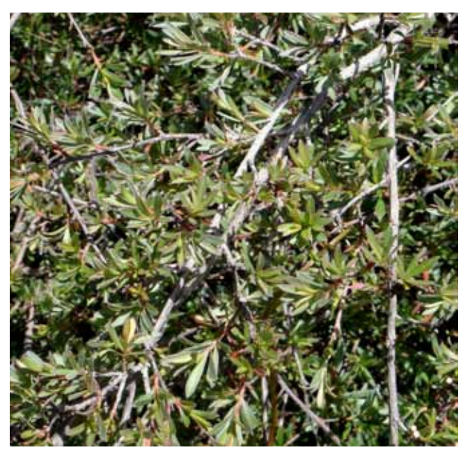
Fig. 1. Kunzea sinclairii endemic to Great Barrier Island where it is a specialist of rhyolite rock habitats.