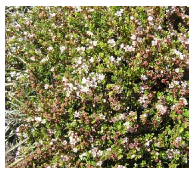
Fig. 4. Kunzea aff. ericoides (a) – a largely western North Island and north-western South Island unnamed species that specialises in mobile dune systems where it can form (and once did form) extensive forests. Most of these have been destroyed for fire wood and pine plantations, however large examples still exist along the South Kaipara and Pouto Peninsulas. This image shows a decumbent form growing on sand filled ledges on islands off Wharariki Beach. Kunzea aff. ericoides (a) is a fast growing plastic species which can develop decumbent or tree forms depending on the degree of exposure and mobilty of the surrounding sand.

The study found that the combined rDNA ETS and ITS data sets enabled a clearer more predictive infrageneric classification to be established; confirmed that Angasomyrtus was better placed in Kunzea ; and supported (with the exception of Angasomyrtus) the geographic partitioning of the genus. More significantly, from the New Zealand point of view, the paper confirms that Kunzea ericoides s.s. (Fig. 3) (and its close allies) are correctly placed in Kunzea, that K. ericoides is a New Zealand endemic (and in the strict sense is confined to the northern third of the South Island) and that other Australian and New Zealand plants placed by Thompson (1983) in K. ericoides though allied are distinct from that species. Further there is molecular support for the potential recognition of 13 new segregates from K. ericoides s.l. (3 from Australian, 10 from New Zealand (see examples illustrated in Figs 2 & 4). As a result of these findings, Kunzea is now formally partitioned into four subgenera and eight sections arranged as follows: