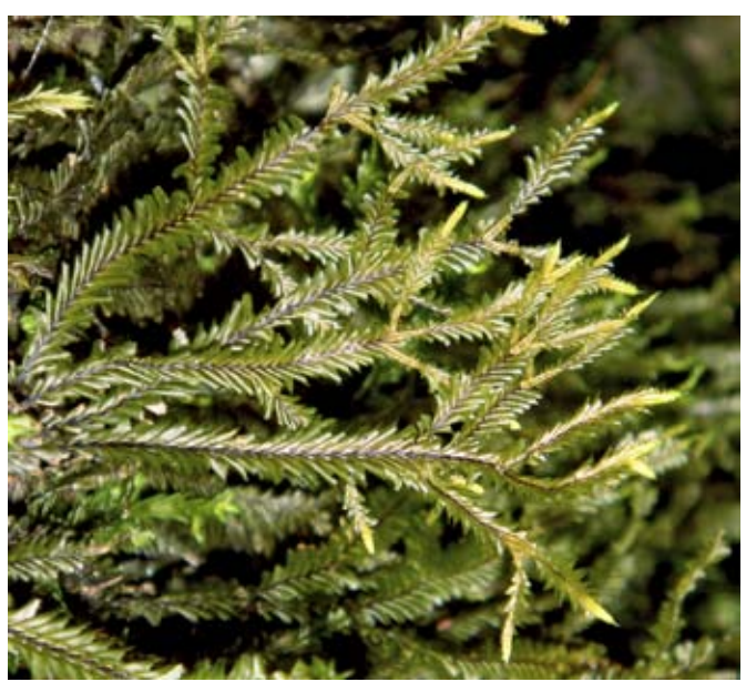
Fig. 1. A plant of Plagiochila arbuscula var. arbuscula growing on scoria on the Lava Caves track, Rangitoto Island. This specimen is bearing perianths. The Chatham Islands has this variety (which has long been known in New Zealand—incorrectly—as P. obscura ) as well as the new endemic var. rekohuensis .