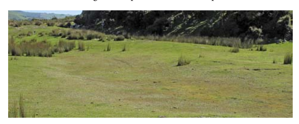
The ephemeral wetland with Lobelia perpusilla and Parahebe canescens.

Back at my Dunedin home, I periodically checked the pot of L. perpusilla and, on one such occasion, noted a small creeping herb that I initially dismissed as a new shoot of L. perpusilla. Under the hand lens, however, I realised it was something very different and, after consulting a couple of references, determined the plant to be P. canescens. By late January 2011, the plant had still not flowered but I wondered if it might be flowering in the wild. On 27 January I made another trip back to Okia Flats and this time the ephemeral wetland was dotted with masses of white Lobelia flowers. At the southwestern end there were a couple of patches of blue flowers which, sure enough, turned out to be P. canescens. After looking through its potential habitat there, it seems to be present in just a strip c. c0.5 m on the gentle slope of the wetland depression.