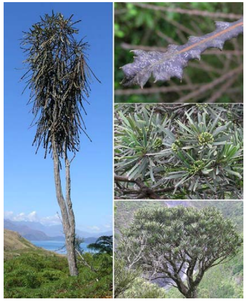
Figure 1. Pseudopanax ferox . Clockwise from left: juvenile, Wanaka; apex of juvenile leaf, Waipori; adult leaves and flowers, Rimutaka; adult, Rimutaka. As a juvenile, P. ferox is distinguished from P. crassifolius by the three-dimensionality (rather than size per se) of the teeth along the leaf margins. This is especially evident at the apex, which appears to "bubble". The adult leaves of P. ferox are shorter, narrower, with nearly parallel-sides and a fairly blunt apex compared with P. crassifolius .

Many of New Zealand's plants are threatened or have disjunct distributions; some are both threatened and disjunct. We have recently published a paper on the geographic distribution of genetic variation in one such plant species: fierce lancewood, Pseudopanax ferox (Shepherd & Perrie 2011; available on request, <a href="mailto:leonp@tepapa.govt.nz">leonp@tepapa.govt.nz</a>). Here, we introduce that study and summarise its findings. We then discuss general implications for conservation management in New Zealand, before returning to the specifics of the conservation of P. ferox (Fig. 1).