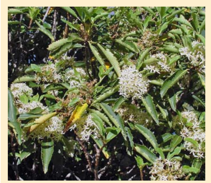
Pittosporum dallii.

Plant of the month for March is Pittosporum dallii . This is a distinctive small tree that can grow up to 6 m tall with a trunk reaching 200 mm diameter. It is endemic to the South Island where it is found in silver beech forest and subalpine scrub in Kahurangi National Park in the North West Nelson area.