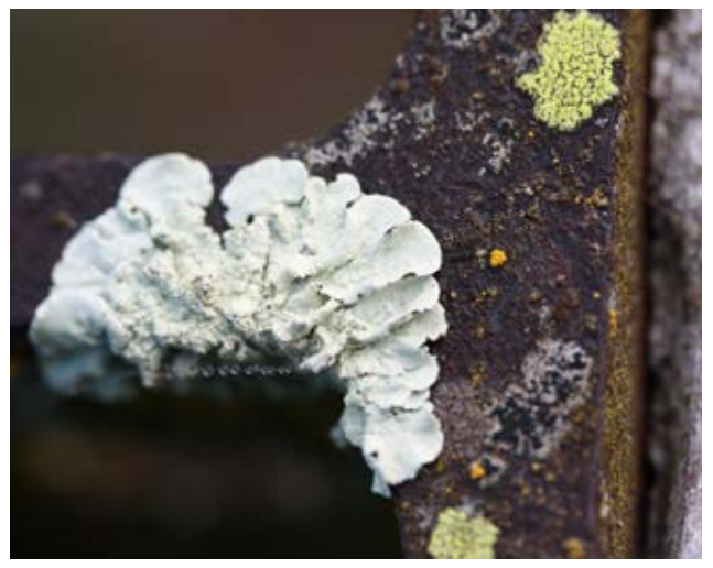
Figure 3. Rhizocarpon geographicum on Middlemarch stockyards railing.