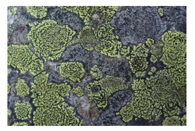
Figure 2. Rhizocarpon geographicum mosaic on Central Otago rock, Photo: Barrie Wills.