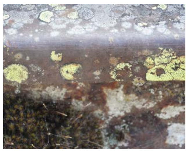
Figure 4. Rhizocarpon geographicum on Conroy's Gully signpost railing.

Nineteen years ago when we bought a property in the Teviot Valley, Central Otago, our gateposts were topped with hard, polished "Chinaman" (stained, naturally polished quartz) rocks collected from nearby paddocks and, on their upper surfaces small colonies of R. geographicum were happily growing. I subsequently saw R. geographicum colonising gravel chippings in bitumen, on walls, bridge cappings and gravestones in cemeteries in lowland and urban habitats (Galloway 2007: 1538). Over the past few years, I have also noticed the characteristic yellow thalli of R. geographicum on old, rusted number 8 wire of high-alpine fence lines on the Old Man Range, Kakanui Mountains and above Poolburn on North Rough Ridge, and particularly on rusting, abandoned coils of wire. Indeed, R. geographicum seems to like growing on hard mineralised surfaces such as rusting iron and you can sometimes find it on rusty iron framing around sheepyards (Figure 3) and on signpost supports (Figure 4). In my home suburb of Opoho, not far from the Dunedin Botanic Gardens, R. geographicum has established very happily indeed on the upper surfaces of smooth brick fences, reaching diameters of 1–5 cm of individual thalli and composite thalli of up to 16 cm diameter, on the top of a fence built c. 70 years ago (Figure 5).