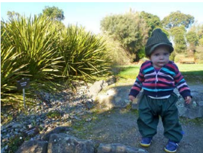
Figure 3. Aciphylla horrida and toddlers is a combination that induces panic in parents