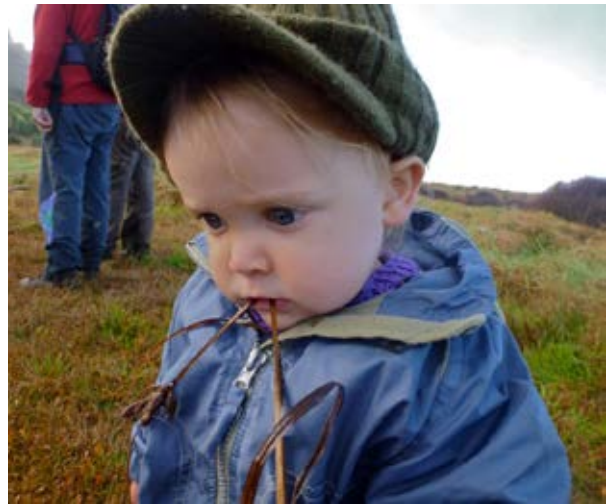
Figure 1. Diagnostic tasting is very helpful

There are some perils to look out for, mostly in the form of the eye-level-of-little-people spikes of Aciphylla (Fig. 3). The native sections of botanical gardens have them scattered about willy nilly with seemingly no regard for a parent's shattered nerves. Other perils are not so obvious, such as when you lie your baby down on a soft patch of turf then, when you pick her up, you find to your horror that you've left a baby-shaped depression in an otherwise perfect mound of Azorella trifurcata in Peter Johnson's immaculate garden (Fig. 4). But spiky Spaniards aside, botanising with little people can be a relaxing and rewarding experience for all. Sowing the seeds of a love of plants early on can only be a good thing. And, if nothing else, plenty of fresh air is a sure fire way of getting to that Holy Grail—a sleeping baby.