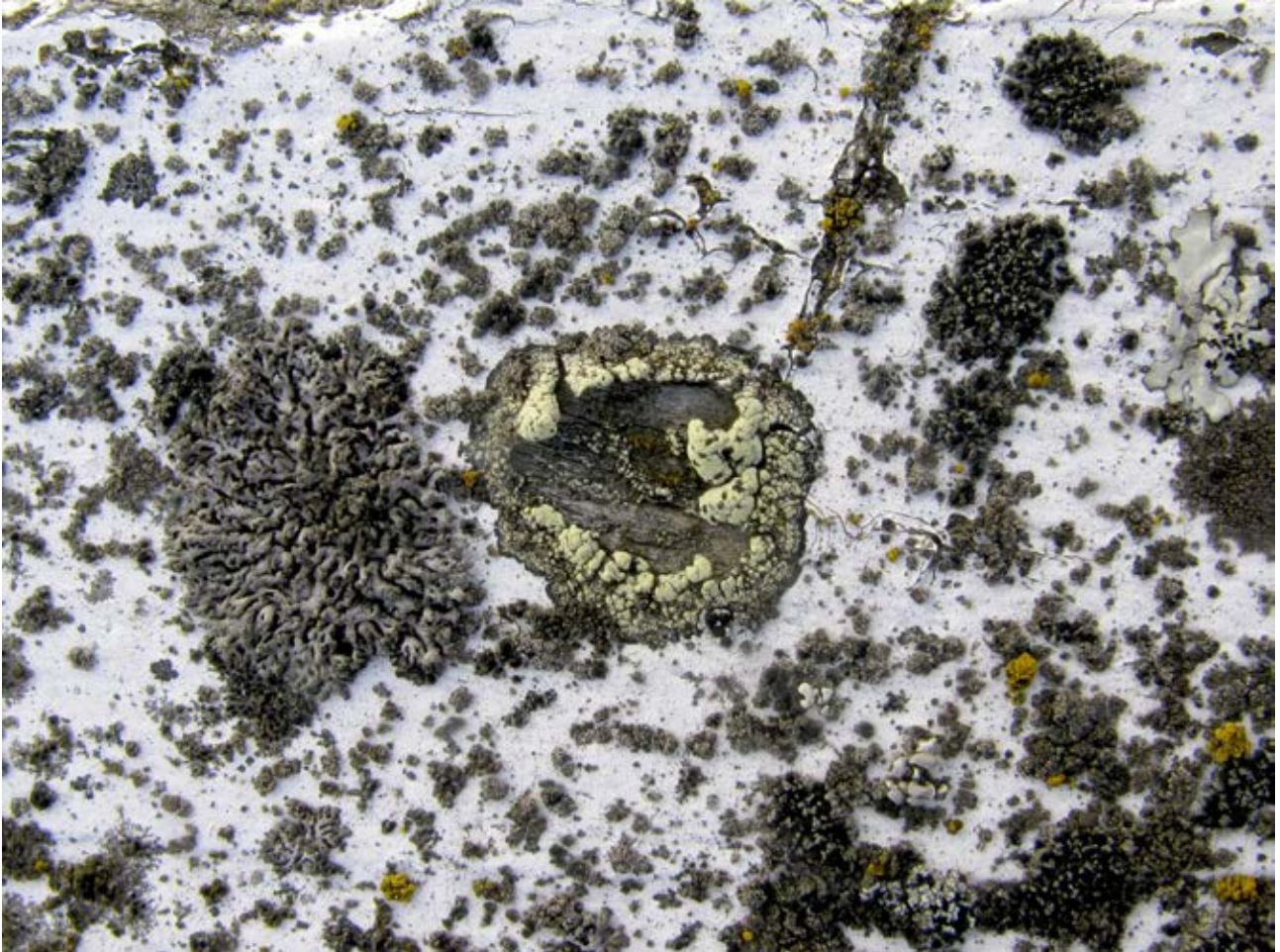
Figure 1. Rhizocarpon geographicum (right) and Physcia dubia (left) on painted white, wooden fence in Scotland Street, Roxburgh, Central Otago. The eroded central portion of the Rhizocarpon has exposed the underlying tannalised timber on which Lecanora polytropa and Candelariella vitellina are growing.

Rhizocarpon geographicum on a painted wooden fence: in the last issue of Trilepidea I drew attention to the lichen Rhizocarpon geographicum growing on a painted wooden fence in Scotland Street, Roxburgh, Central Otago ( Trilepidea 127, p6). I inadvertently omitted to send the image of this so here it is now (Fig. 1).