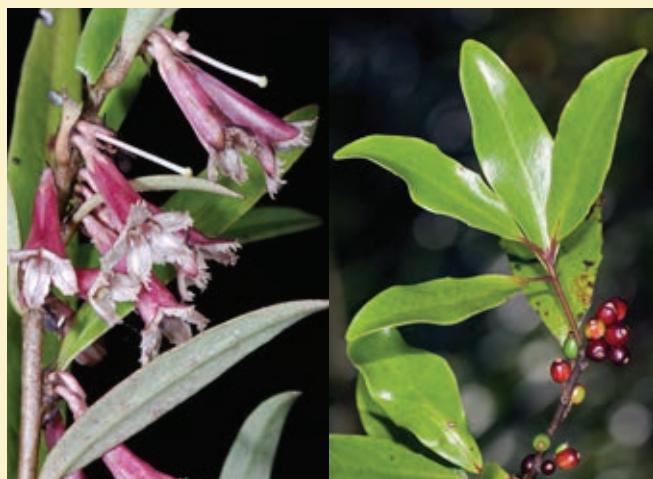
Alseuosmia quercifolia .

of the grove" after the sweet smell of these flowers and the species name " quercifolia " relates to the oak-shaped leaves. A great scented garden addition, best planted in partial shade in rich, moist soil. It is not threatened.