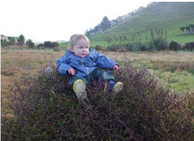
Figure 2. Gabi in ribbonwood ( Plagianthus divaricatus )