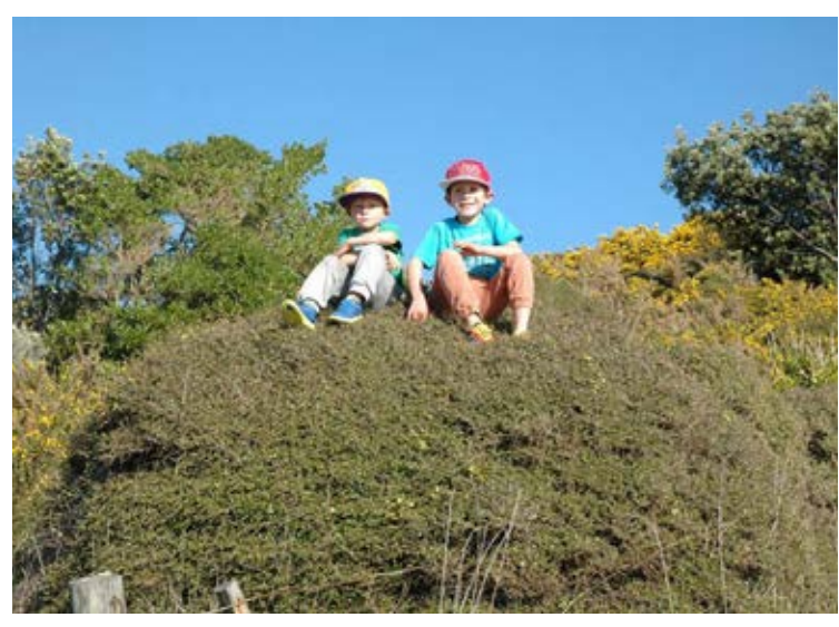
Enjoying the comfort of Melicytus crassifolius.

A small group of people is working with the Porirua City Council to develop a plan to restore native habitat in Stuart Park, Titahi Bay. This is a steep coastal cliff site backed by undulating pasture grassland with mahoe-ngaio (kohekohe) in the inland gullies. Until recently, the pasture area was used by a local horse riding group, which helped to keep the gorse and other weed species down. The overall aim of this project is to nip the gorse in the bud by replacing it with native coastal species, and gradually changing the dominance of pasture grassland to a silver tussock (Poa cita) dominant grassland.