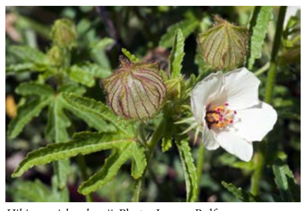
Hibiscus richardsonii.

Hibiscus richardsonii was recently discovered in the Tokomaru Bay area, north of Gisborne. The species was found during pampas eradication along this remote coastline. This finding extends the known range for H. richardsonii further south; Hicks Bay had formerly had this distinction. This same area is also home to other recently discovered botanical treasures, namely, Sonchus kirkii (puha), Euphorbia glauca (shore spurge), Plantago picta (papa plantain), which is endemic to this area, and Pimelea xenica (pinatoro).