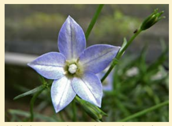
Wahlenbergia matthewsii.

Plant of the month for September is Wahlenbergia matthewsii . Wahlenbergia belongs to the campanula family and has a wide distribution, especially in the southern hemisphere.