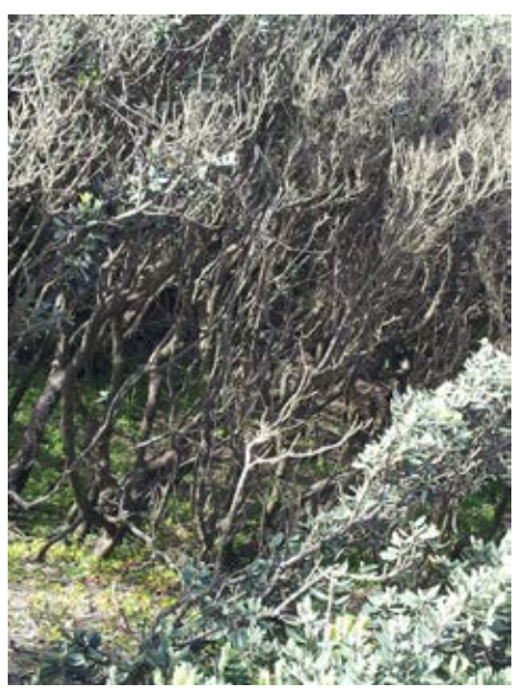
Figure 3. Leptinella rotundata habitat on the Ripiro Beach— Leptinella grows under wind-shorn pohutukawa ( Metrosideros excelsa ) in dune hollows.

Collectively then, since the species was first described, the number of Leptinella roundata sites has increased to 11 spanning the west Northland coastline from Te Paki south to the Waitakere Ranges. Despite these gains—and note that there have been as yet no population losses— Leptinella rotundata