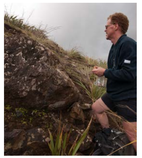
Figure 5. Leptinella rotundata plants grow in exposed coastal turf around margins of basalt boulders, at Maunganui Bluff. Although not a preferred habitat, provided there is a little shelter Leptinella can persist in these situations and sometimes may even form large colonies.

Seasonal drought, although killing Leptinella , has also been noted as aiding it through the elimination of other associated ground covers. It seems that so long as some stems of Leptinella persist, it can rapidly recolonise those sites where other herbs have been drought stressed 'out'.