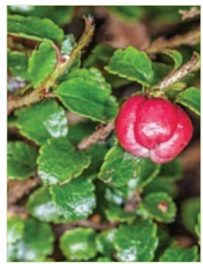
Gaultheria depressa var. novae-zelandiae.