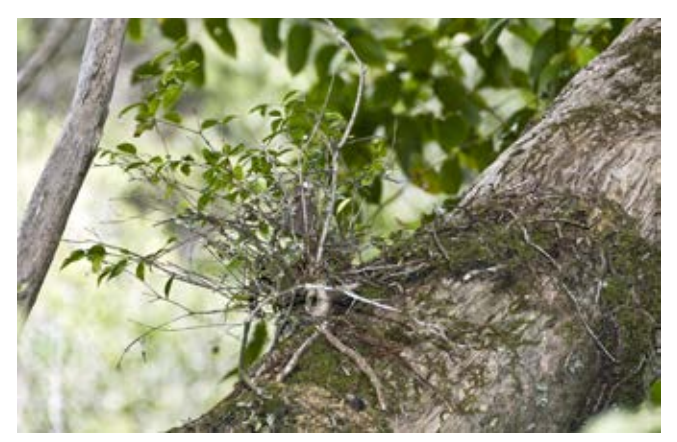
Figure 2. An epiphytic seedling of Metrosideros bartlettii , Te Paki.