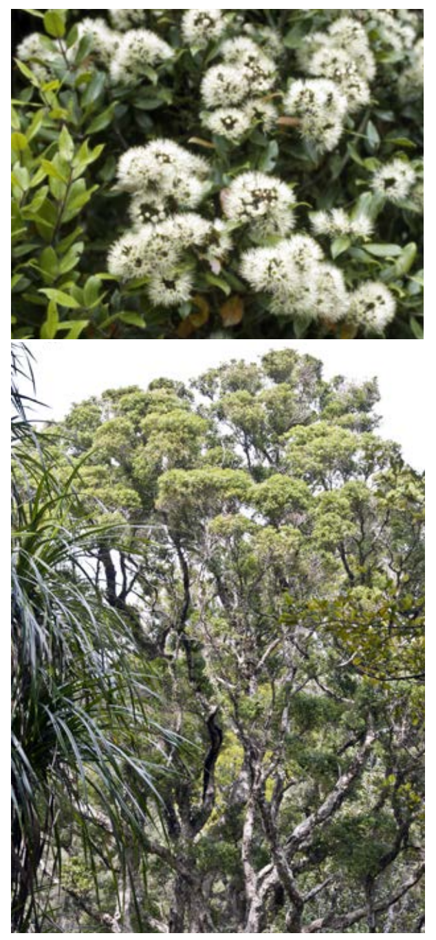
Metrosideros bartlettii, Te Paki.

Many people obviously know of this magnificent "Threatened/Nationally Critical" rata because some specialist nurseries sell it and it can be found growing in several universities and botanical gardens throughout the country. An article further describing the winner and its story features elsewhere in this newsletter. Here are some of the of the fantastic and knowledgeable comments made by you the voters: