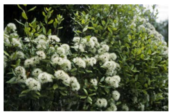
Figure 1. Metrosideros bartlettii , Te Paki.

A mature rata moehau specimen can reach an impressive height of 30 metres, with a massive trunk as large as 1.5 metres diameter. Rata moehau, like northern rata, begins its life as an epiphyte (see Fig. 2). Germination occurs on the limbs of species such as puriri ( Vitex lucens ), kohekohe ( Dysoxylum spectibile ), and taraire ( Beilschmedia tarairi ) or on the trunk of mamaku ( Cyathea medullaris ). The sapling then sends its roots down into its favoured damp substrate below. The trunk will form initially