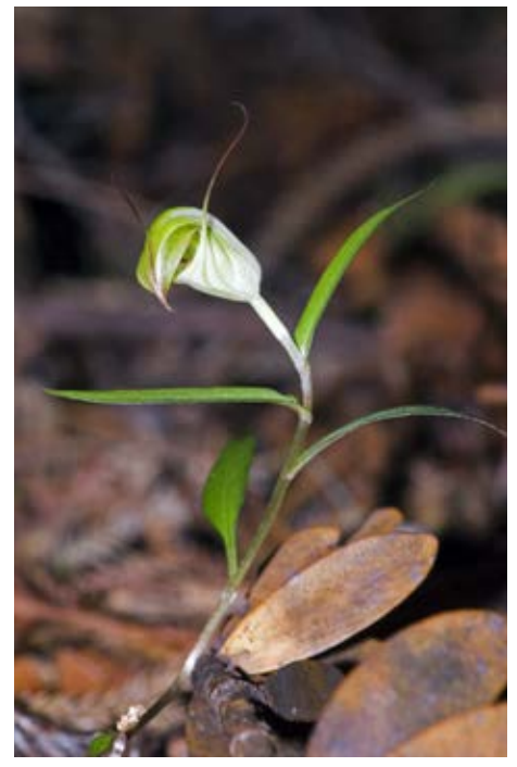
Pterostylis brumalis, Kauri Glen, Northcote.