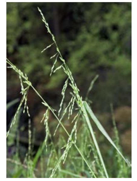
The distinctive seed heads of the 2014 Worst Weed— Ehrharta erecta.

Some of the very annoyed comments (wow, this plant really angers people) made by voters include: