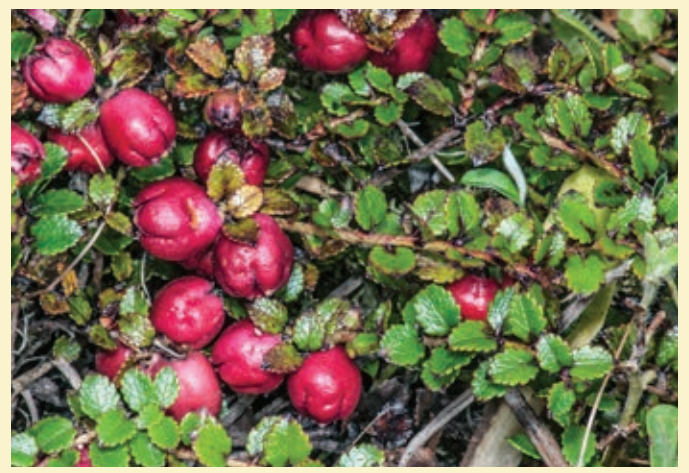
Gaulthertia depressa var. novae-zelandiae.

Plant of the month for December is Gaultheria depressa var. novae-zelandiae (snowberry).