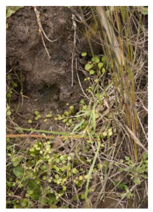
Figure 2. Leptinella rotundata habitat, Te Paki. In this image Leptinella plants grow at the head of an erosion scar amongst oioi ( Apodasmia similis ) and dried off harakeke ( Phormium tenax ).

However, aside from a 1996 visit to Mitimiti, where another population of Leptinella was found close to Anderson's 1990 site, no further populations were found until 2009 when one of us (Andrew Townsend) discovered a new population on the west coast of Te Paki near Scott Point. That population appears to comprise females and male plants (Fig. 1) and grew scattered over several kilometres of coastline in much the same habitat as that already described for Arai Te Uru, Hokianga (Fig. 2).