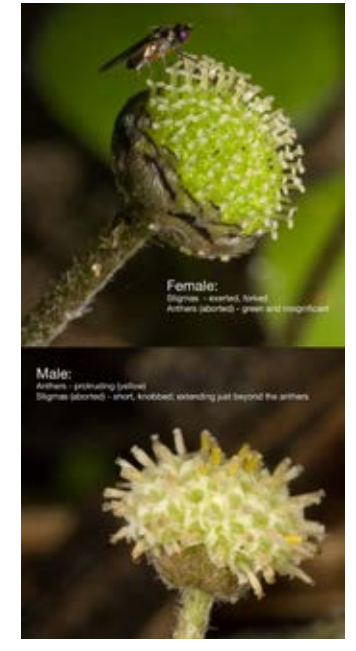
Figure 1. Leptinella rotundata female and male capitula, Te Paki population.

In 2010, a chance encounter by PdL with Cam Kilgour (now