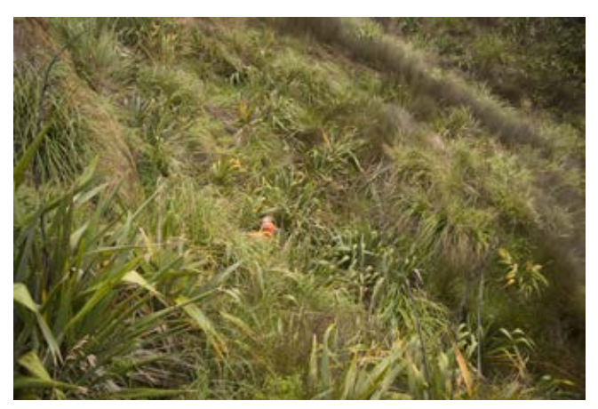
Figure 4. Another example of Leptinella rotundata habitat at Te Paki, here plants grow in light gaps amongst harakeke, oioi and wiwi ( Ficinia nodosa ) and toetoe ( Austroderia aff. splendens ).

We now have some better idea of this species' ecology. In summary, we have observed that, with the exception of the Ripiro Beach and some of the Waitakere Range populations that grow within sand dunes, all the other ones have been found on coastal headlands and cliff faces, invariably within the ecotone being coastal scrub and tree land, flax land and oioi rush land (Fig. 4), in coastal turf, especially in those places kept open by salt blast and wind ablation (Fig. 5). Whilst thriving in semi-shade, the species clearly requires vegetation 'windows' and is soon lost where the overlying vegetation thickens, or through competition from other ground covers like Tetragonia implexicoma .