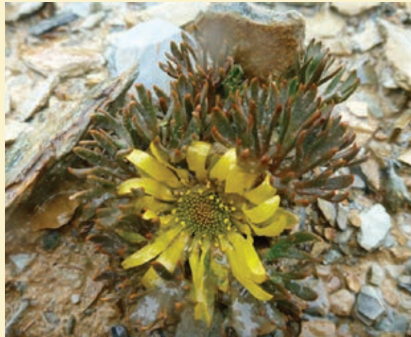
Ranunculus scrithalis .

The plant of the month for February is Ranunculus scrithalis , one of many Ranunculus species endemic to New Zealand. The species is adapted to life in the extremes of the mid to high alpine zone. It is found only on a very specific type of habitat—consolidated fine clay rich scree with a thin coating of fine loose gravel over the top. It has a very restricted distribution, being found only