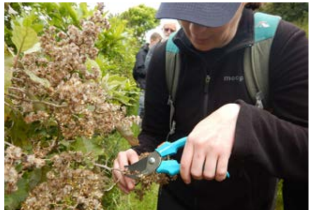
Sampling rangiora ( Brachyglottis repanda ) seed at Otari Wilton's bush as part of the practical day in conjunction with the seed bank workshop in Wellington in December.

Collecting expeditions are already planned for Auckland (Myrtaceae), Taranaki (alpine species and Myrtaceae), the Central Plateau (alpine species, Fabaceae and Myrtaceae), Manawatu (Fabaceae), Wellington (Fabaceae and Myrtaceae), Nelson and Marlborough (alpine species and Fabaceae), Canterbury (alpine species and Fabaceae) and Otago (alpine species and Fabaceae). These are the areas where there are a relatively large number of trained collectors. The seed bank coordinator will be in touch shortly with trained collectors in these areas with details of the expeditions. The seed bank is always pleased to receive collections from any location and invites trained collectors in all areas, including those mentioned above to contact the seed bank coordinator with your collecting plans for 2017.