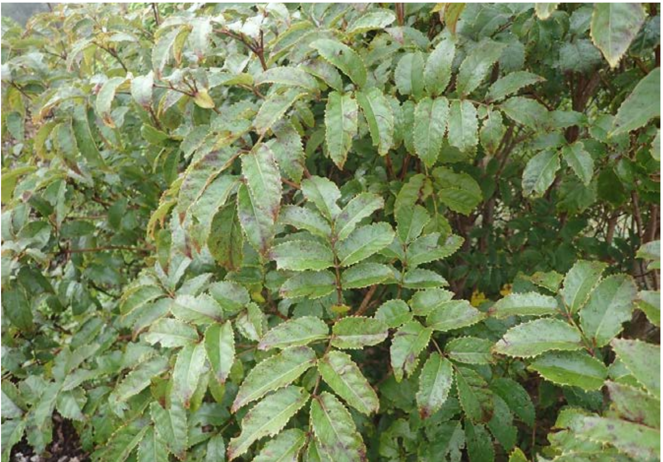
Figure 3. The lush foliage of the large-leaved Turoa Onamata.