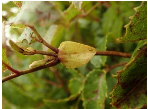
Figure 2. The large petal like stipule of Turoa Onamata ( Ackama nubicola).