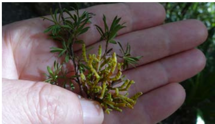
Figure 2. Korthalsella salicornioides on host Kunzea robusta, Ross Creek, 4 November 2018.