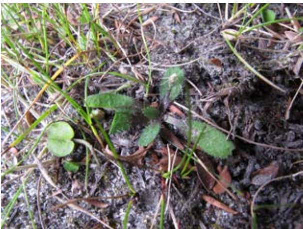
Figure 6. Young plant of Solenogyne christensenii growing in open herbfield near the source of the Clutha River, Wanaka, Otago, New Zealand.

Abrotanella christensenii might be an indigenous species of Solenogyne rather than a synonym of the introduced S. gunnii ? With this in mind I checked the holotype of Abrotanella christensenii held at the Museum of New Zealand Te Papa Tongarewa Herbarium (WELT) (Fig. 3)—a perfect match!