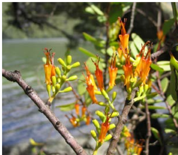
Alepis flavida .

The parasitic species has leap-frogged from being unrecorded in the forest to having 21 plants seen within one host tree alone. On a single day in February this year Trust volunteers and staff found 109 new plants on 49 host trees, a record daily tally for the area.