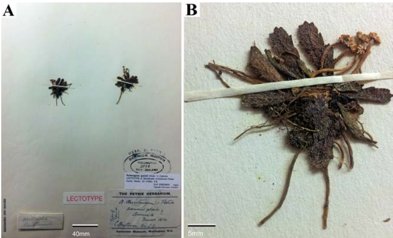
Figure 3. Holotype of Abrotanella christensenii (WELT SP02098).

species as ‘ Incertae Sedis ’, had another look, noting that ‘ the sp.[ecies] is known only from 2 small species, Cheeseman... found the material ‘insufficient to satisfy me [Cheeseman] that the species is a true Abrotanella ’. Allan opined that Abrotanella christensenii ‘ may possibly prove to be a Cotula ’. There the matter rested until 1993 when Ulf Swenson, then engaged in the completion of a revision of Abrotanella , revisited the status of A. christensenii , recognising that both Cheeseman and Allan were right, it was not an Abrotanella but a species of Solenogyne , S. gunnii (Swenson 1993). Solenogyne gunnii (Fig. 4) is a naturalised plant in New Zealand (Webb et al. 1988), so there the matter rested, Christensen’s enigmatic daisy, known only from the holotype was now an introduced weed, and so being relegated to weed status it was almost—but not quite—forgotten.