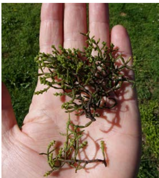
Figure 1. Korthalsella salicornioides detached from its host, Ross Creek, 4 January 2017.

Following the arrival of myrtle rust ( Austropuccinia psidii ) to New Zealand in 2017, the threat status of both Kunzea robusta and Korthalsella salicornioides (as the sole non-myrtaceous plant known to be intimately associated with NZ myrtaceae) were elevated to 'Nationally Vulnerable' and 'Nationally Critical' respectively (de Lange