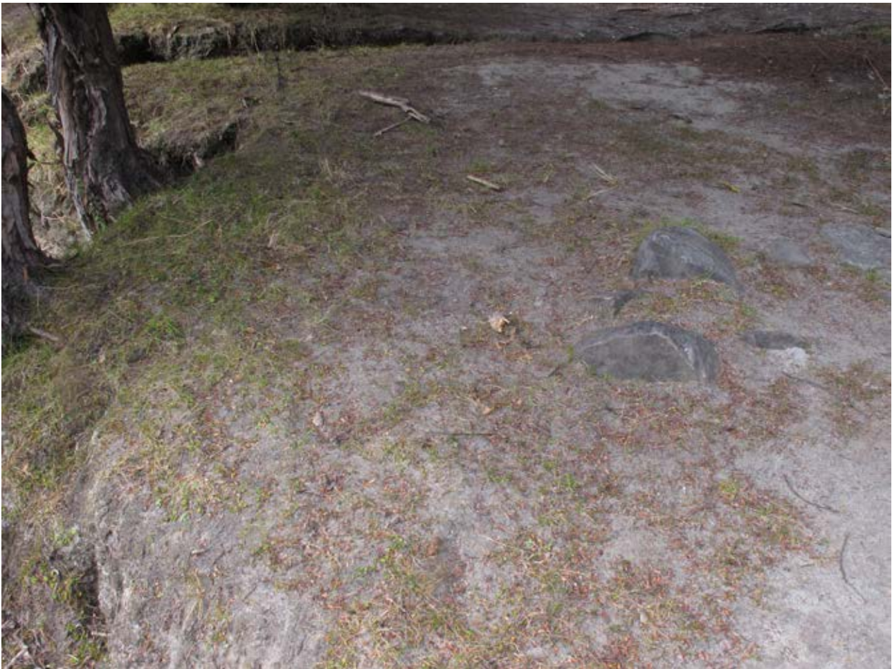
Figure 5. Solenogyne christensenii habitat near the source of the Clutha River, Wanaka, Otago, New Zealand.