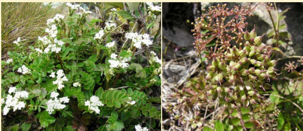
Gingidia haematitica . (left) In flower, December 2006; (right) Seed heads, January 2012.

The plant of the month for July is Gingidia haematitica , one of nine Gingidia species endemic to the New Zealand region. G. haematitica is a basicole (base rich soil loving) species that grows on dolomite karst landscapes at the top end of the South Island. The species has an extremely restricted distribution and is only found on Mt. Burnett, where it grows in open sunny areas on rocky outcrops. The plant is an herbaceous perennial with glabrous, pinnate leaves that are bright green or sometimes bronze-green in more exposed conditions. The leaflets are typically in seven to eight pairs with crenate teeth on the margins of each leaflet. The species has white flowers and is gynodioecious. Both male and female flowers are borne in umbels atop stems that are slightly taller than the leaves. The seeds are brown with five ribs.