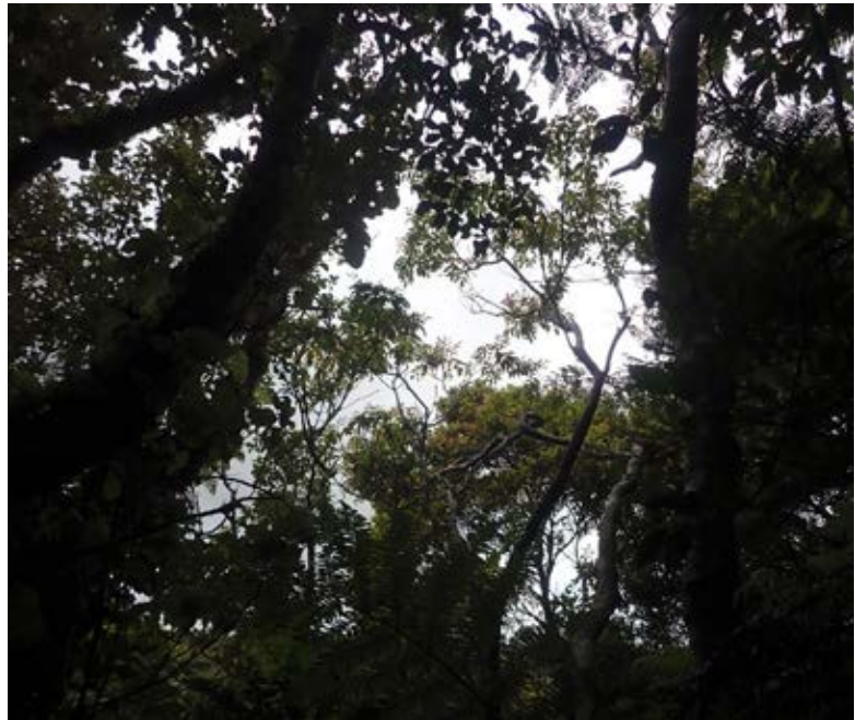
Figure 4. Perhaps the largest specimen of Turoa Onamata a 15m tree canopy tree seen in the centre.

One of the ‘populations’ is one large tree seen in Figure 4, a 15m canopy tree being the largest tree of this species on record ( https://inaturalist.nz/observations/42025181 ). It is growing on a southern facing old slip face with an understorey of Austroblechnum colensoi , another cold-loving species rare in the far north. The Waima forest has several narrow-ranged cold climate endemics including Coprosma waima , Olearia crebra and turoa onamata which are thought to be possible relics of a once colder land. Potentially explaining why Waima forest, which does not have unique geology, hosts a relatively large proportion of endemic plants. The wet and often cloudy weather makes Waima one of the cloudiest and wettest parts of Northland. It has been known to snow on the Waima tops, once in the 1930s and again in the early 2000s.