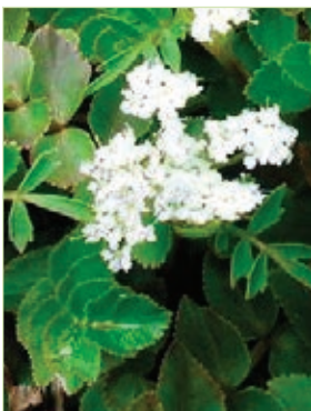
Gingidia haematitica .