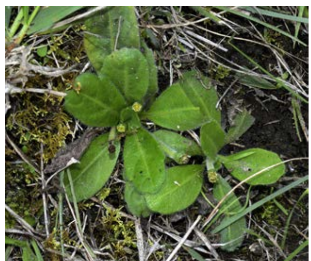
Figure 4. Solenogyne gunnii, Cashmere Hills, Christchurch, New Zealand.