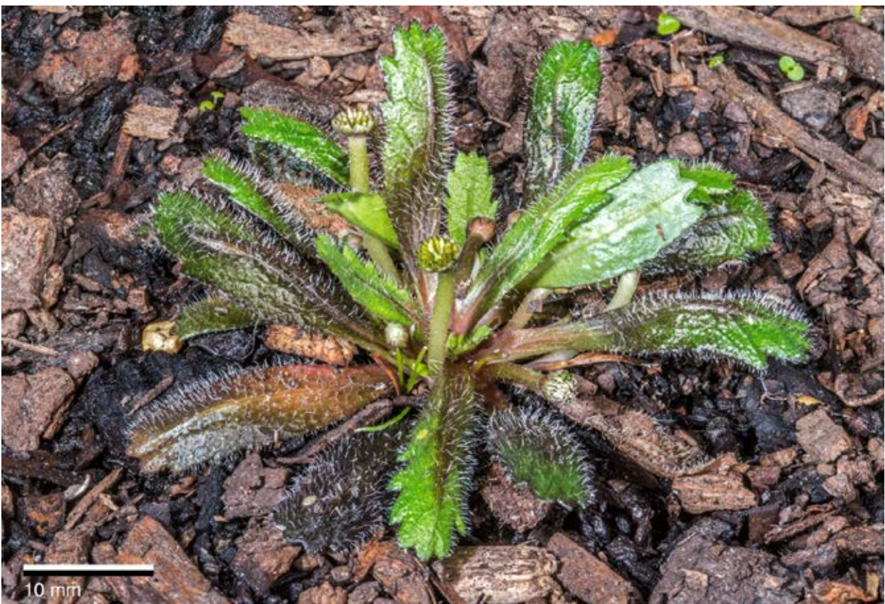
Figure 7. Cultivated flowering and fruiting plant of Solenogyne christensenii .