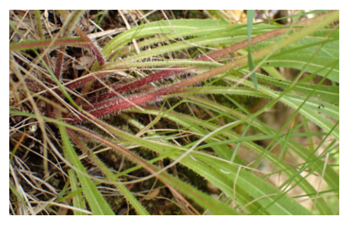
Figure 3. Narrow leaves of Picris angustifolia subsp. merx-muelleri .