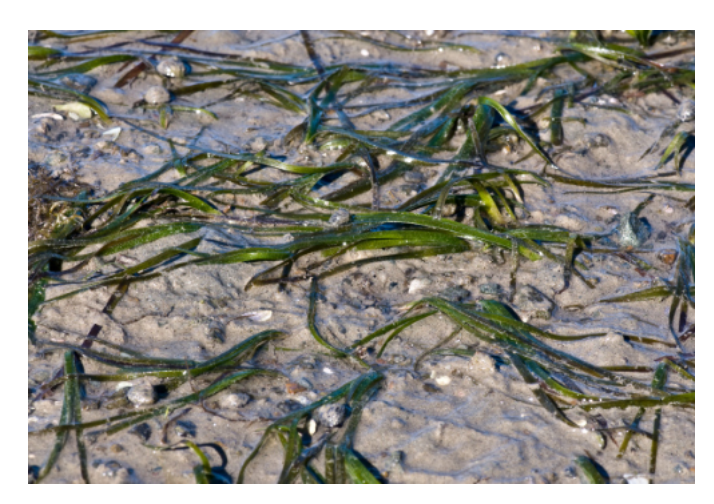
Rimurehia, seagrass ( Zostera muelleri subsp. novazelandica came second in the Favourite Plant vote.

Among these well-known bright and vibrant flowers have been a great diversity of native plants. Like Zostera muelleri novozelandica (rimurehia, seagrass) that can be found submerged in our estuaries and the rootless Wolffia australiana (water-meal) that can be found floating in our wetlands throughout Aotearoa. Another newcomer is the lichen, Aptrootia elatior, this is the first time a lichen has been in the top 10 for the NZPCN Favourite Plant vote. At the last minute Urtica ferox swooped in to take 10th place. A plant that demands respect and is no stranger to the top 10.