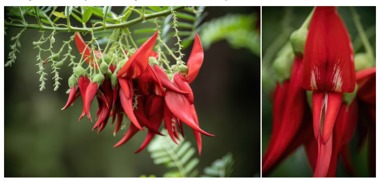
Kōwhai ngutu-kākā (Clianthus maximus) in flower.

Over the last month we've cast our votes, created memes, and battled it out for our favorite plant! This year's winner of the favorite plant of 2023 is Clianthus maximus (kōwhai ngutu-kākā). Congratulations to everyone voting and campaigning for this beautiful plant. Clianthus maximus spent the last month battling it out for first place, showing how much we love this plant and its beautiful flowers.