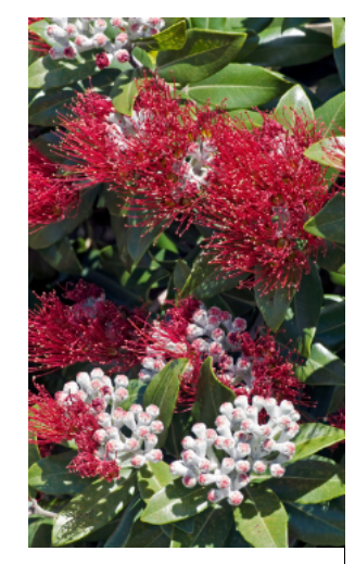
Põhutukawa / Metrosideros excelsa, New Zealand's Christmas tree came fifth in the vote for our Favourite Native Plant.

Many of us will be anticipating the holiday break as a chance to relax with family and friends or perhaps quietly potter about at home working on personal projects, and of course the hills and wild places beckon with promises of adventure and new plants to meet. Whenever I encounter a new plant, it is often the people I am with and the places we