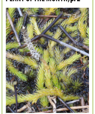
Brownseya serpentina.