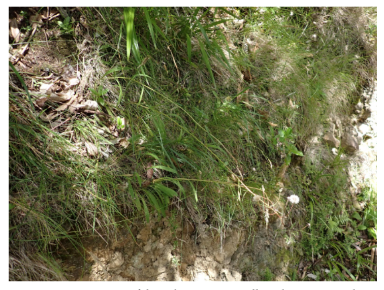
Figure 1. Picris angustifolia subsp. merxmuelleri above cut track on clay bank with grasses.

tribe Cichorieae Lam. & DC. (which has also been known as Lactuceae) and are superficially similar. They differ vegetatively by the stem and leaf indumentum, Helminthotheca echioides or 'bristly' oxtongue has 2-, 3-, 4- or 5-hooked anchor hairs and the hairs of the leaves arise from a conspicuous swollen base, while our native Picris species have 2hooked, bristly hairs. (de Lange, 2023a). In the flowers, the involucral bracts of bristly oxtongue are in two rows, with the five outer involucral bracts ovate to cordate, and the apex of the inner bracts feather-like (de Lange, 2023a). Further, the achenes of the introduced oxtongue (H. echioides) are heteromorphic: the