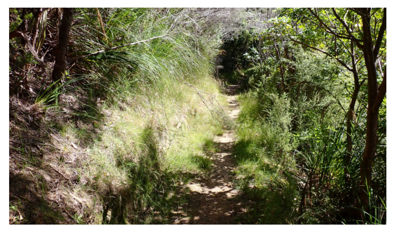
Figure 6. Woodland like track habitat where this population was found. All photos: Marley Ford – 12 January 2023

Havelock population and the ultimate succession of the surrounding forest could further risk this population but perhaps the track clearing and steep slips will sustain it here.