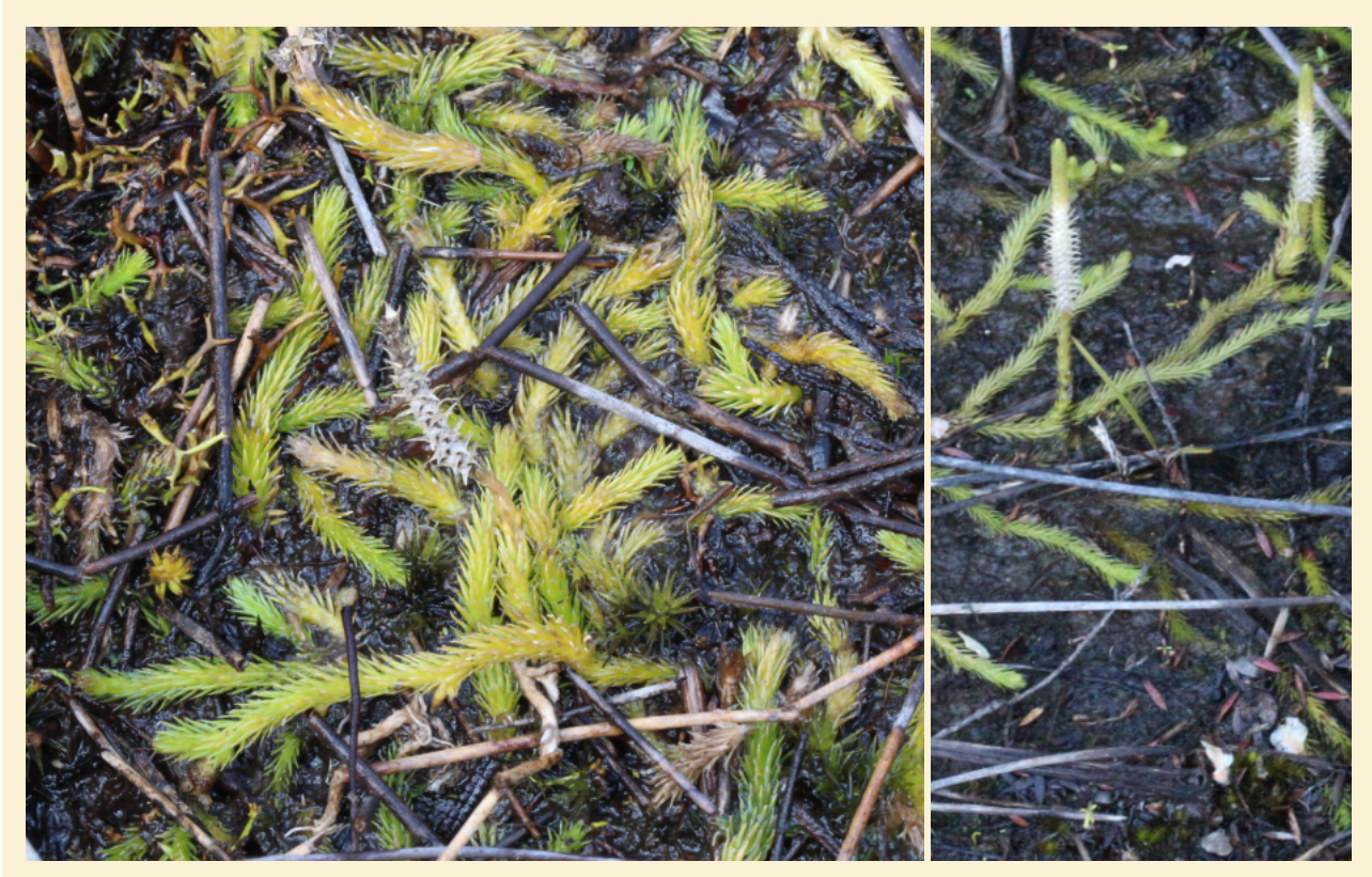
Brownseya serpentina : (left) typical growth habit and appearance, Lake Ohia 8 August 2015; (right) plants with fertile cones, Lake Ohia 5 August 2018.

Plants have a prostrate growth habit and are often yellow-green in colour. The distinct coloration and the ground hugging growth habit help distinguish this species from another clubmoss, Lateristachys lateralis , often found growing in the same environment.