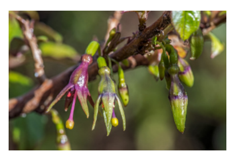
Fuchsia excorticata.