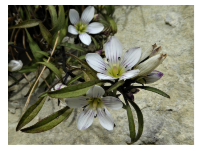
Manahune gentian ( Gentianella calcis subsp. manahune) was passionately campaigned for and a strong contender for the 2023 favourite plant vote.