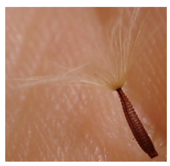
Figure 2 . Cypsela showing pappus (top) and achene (bottom) of Picris angustifolia subsp. merxmuelleri .

Of the four members of Picris in New Zealand, P. angustifolia differs by the achenes gradually tapering into a cuspis more than 0.2 mm long (separating it from Picris hieracioides) (Figure 2) and; the outer involucral bracts are in 2-3 rows, rarely the longest outer bracts are longer than 3/3 of length of innermost bracts—usually markedly shorter (usually many outer bracts are longer than 3/3 of length of innermost bracts—often almost as long as inner bracts in P. burbidgeae), with all the bracts straight, and the outer bracts upright to slightly squarrose, and not as wide as inner bracts (Holzapfel & Lack, 1993). The epithet of this species refers to the narrow leaf (Figure 3). Picris angustifolia has three subspecies, two of which are known from New Zealand, discussed here. P. angustifolia subsp. merxmuelleri is named for the