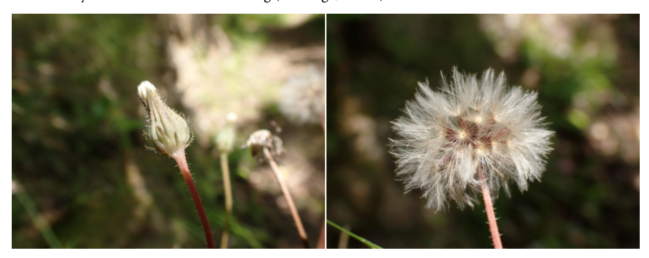
Figure 4 (left). Capitulum of Picris angustifolia subsp. merxmuelleri showing outer involucral bracts hairs that are usually(if present) in a single or double line.

German botanist and taxonomist Hermann Merxmüller (1920–1988). P. angustifolia subsp. merxmuelleri can be separated from the subspecies P. angustifolia DC. subsp. angustifolia by usually having a cymose panicle, the indumentum of the outer involucral bracts being usually fine, hairs if present are usually in a single or double line (Figures 4, 5) and by the shorter achenes and cuspis—the cuspis is from ¼–¼ of the total length (compared with ½–½ of P. angustifolia subsp. angustifolia ) (Figure 2) (Holzapfel & Lack, 1993). Further, in P. angustifolia subsp. angustifolia the rosette leaves have usually withered off before flowering (de Lange, 2023b).