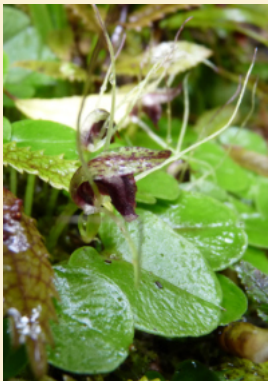
Corybas rivularis .