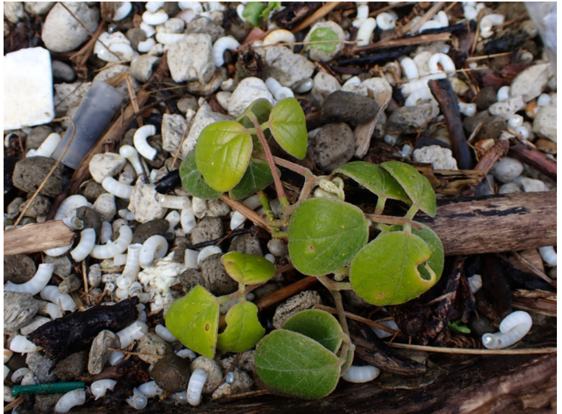
Figure 1. A plant of Canavalia sericea above high tide in flotsam.

The silky Jackbean was located above the high-tide mark, nestled against the dunes alongside Ipomoea pes-caprae subsp. brasiliensis (L.) Ooststr. and Ipomoea cairica (L.) Sweet (Figure 1). Nearby were seedlings of Sabdariffa diversifolia (Jacq.) McLay & R.L.Barrett and the first noted incursions of sea spurge ( Euphorbia paralias L.) in Northland. The plant appears to have arrived naturally, likely germinating from flotsam, as it was growing among pacific pumice, Spirula spirula shells, and ocean plastic ( https://inaturalist.nz/observations/222748482 ). It was removed with the intention to grow it on, but unfortunately, the plant did not survive—making Canavalia sericea a New Zealand vagrant.