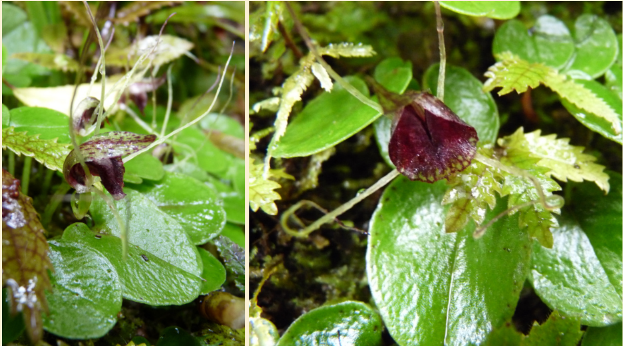
Corybas rivularis flowering at Otangaroa, 5 November 2011.

The plant of the month for August 2025 is Corybas rivularis , one of Aotearoa New Zealand's many spider orchids. Its distribution is still not fully understood, as there are several well-known but yet to be formally described entities aggregated with the described species. It is known to be present in Northland at several locations, with Kaeo being the type locality. This species may also be present in Taranaki and elsewhere, but further work is needed to establish whether populations outside of Northland are indeed Corybas rivularis s.s. The species is an Aotearoa New Zealand endemic, although the genus is not.