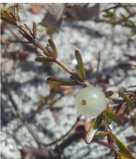
Coprosma brunnea .