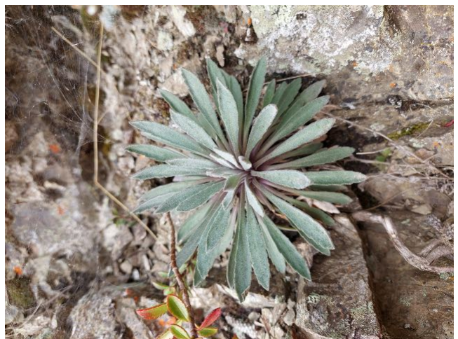
Pachycladon stellatum , 15 December 2022.

Day 2 dawned fine and chilly but soon heated up into a scorcher of a day. Jan and Janet headed off to survey another branch of the catchment, Jemima surveyed for skinks in the hills around camp, while Ben and I took the high road up a side stream to a massive rock outcrop on a high ridge above the valley. As we surveyed our way up the valley looking in every possible place where either the Pachycladon or Cardamine might be we recorded all vascular plant species we encountered along the way. We found some amazing patches of Pterostylis australis and Ewartiothamnus in the scrub zone, then went past a bluff with some good plants of the newly named Pachystegia hesperia growing on it. We hit the jackpot at lunchtime when we reached a high shaded face which appeared to have three different species of Pachycladon growing on it, as well as a sizeable population of a Cardamine that was looking very similar to our target species. This was a great place to stop for lunch! The Cardamine turned out to be C. dimidia , the sister species to C. pachyphylla , but we found Pachycladon stellatum , P. fastigiata , and P. enysii growing within close proximity, and one of the P. fastigiata was flowering which was cool to see. We also spotted, very fleetingly, a large scree