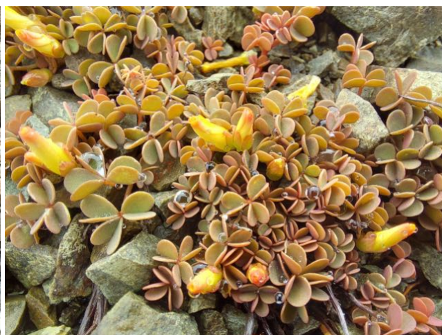
Oxalis aff. exilis 'scree', 15 December 2022.