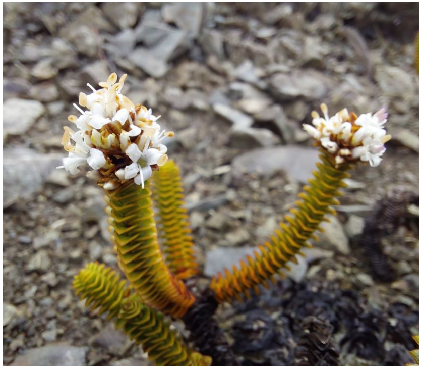
Veronica epacridea , 15 December 2022.