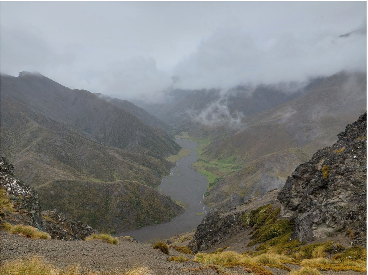
Tone River in the clouds, 15 December 2022.

all couldn't help but notice the massive amounts of ungulate sign around, especially goats, and that most of the palatable native vegetation was heavily browsed. It was a bit of a sad state of affairs, as species like Carmichaelia kirkii had been decimated since Jan's last survey for them in the valley.